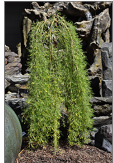
Walker Weeping Peashrub

Walker Weeping Peashrub is recommended for the following landscape applications;