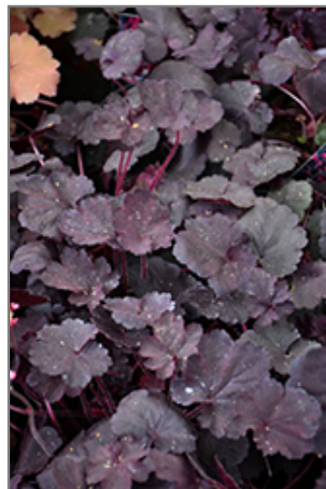
Black Forest Cake Coral Bells foliage