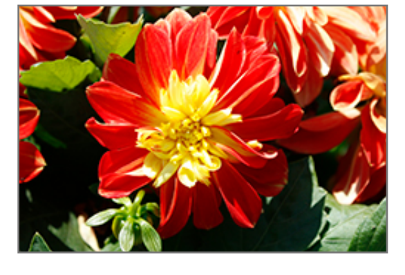
Dalaya Fireball Dahlia flowers