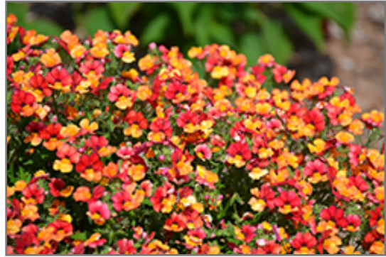
Babycakes Little Orange Nemesia flowers

Babycakes Little Orange Nemesia is a fine choice for the garden, but it is also a good selection for planting in outdoor containers and hanging baskets. It is often used as a 'filler' in the 'spiller-thriller-filler' container combination, providing a mass of flowers against which the thriller plants stand out. Note that when growing plants in outdoor containers and baskets, they may require more frequent waterings than they would in the yard or garden.