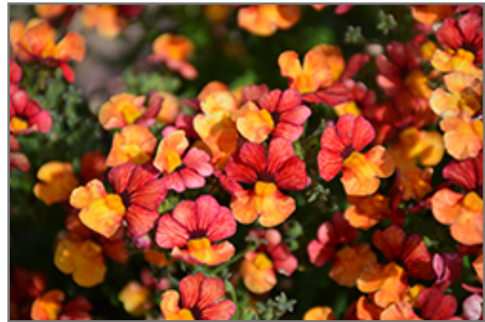
Babycakes Little Orange Nemesisia flowers

Babycakes Little Orange Nemesisia is recommended for the following landscape applications;