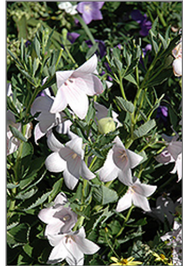
Hakone White Balloon Flower flowers

Hakone White Balloon Flower will grow to be about 18 inches tall at maturity extending to 24 inches tall with the flowers, with a spread of 18 inches. When grown in masses or used as a bedding plant, individual plants should be spaced approximately 15 inches apart. It grows at a medium rate, and under ideal conditions can be expected to live for approximately 10 years. As an herbaceous perennial, this plant will usually die back to the crown each winter, and will regrow from the base each spring. Be careful not to disturb the crown in late winter when it may not be readily seen!