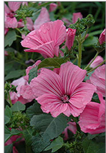
Novella Rose Lavatera flowers