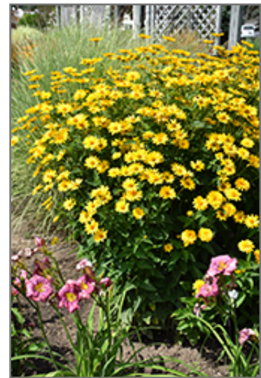
Summer Sun False Sunflower in bloom