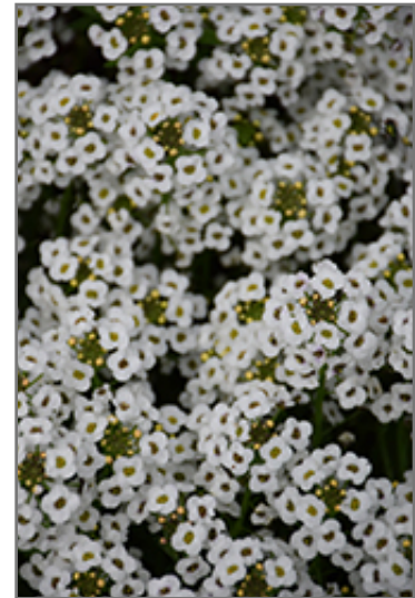
Stream White Sweet Alyssum flowers

Stream White Sweet Alyssum is recommended for the following landscape applications;