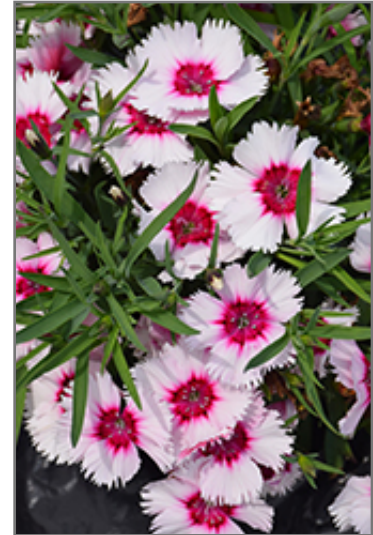
Super Parfait Raspberry Pinks flowers

Super Parfait Raspberry Pinks is a fine choice for the garden, but it is also a good selection for planting in outdoor pots and containers. It is often used as a 'filler' in the 'spiller-thriller-filler' container combination, providing a mass of flowers and foliage against which the thriller plants stand out. Note that when growing plants in outdoor containers and baskets, they may require more frequent waterings than they would in the yard or garden. Be aware that in our climate, most plants cannot be expected to survive the winter if left in containers outdoors, and this plant is no exception. Contact our experts for more information on how to protect it over the winter months.