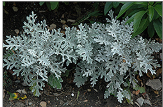
Silver Dust Dusty Miller foliage