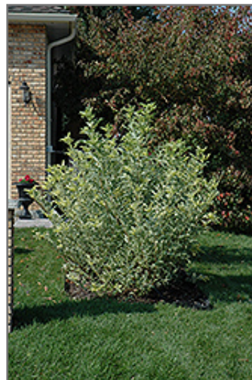
Madonna Elder