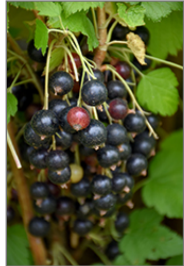
Ben Sarek Black Currant fruit

This is a dense multi-stemmed deciduous shrub with a more or less rounded form. Its relatively fine texture sets it apart from other landscape plants with less refined foliage. This plant will require occasional maintenance and upkeep, and is best pruned in late winter once the threat of extreme cold has passed. It is a good choice for attracting birds to your yard. It has no significant negative characteristics.