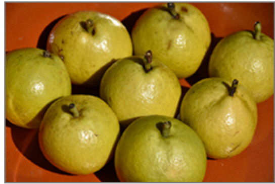
Golden Spice Pear fruit