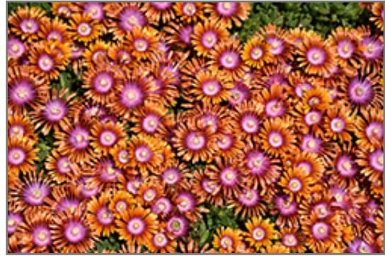
Fire Spinner Ice Plant in bloom

Fire Spinner Ice Plant is recommended for the following landscape applications;