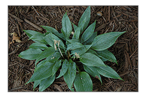
Blue Baron Hosta