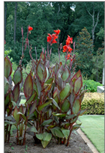
Australia Canna in bloom