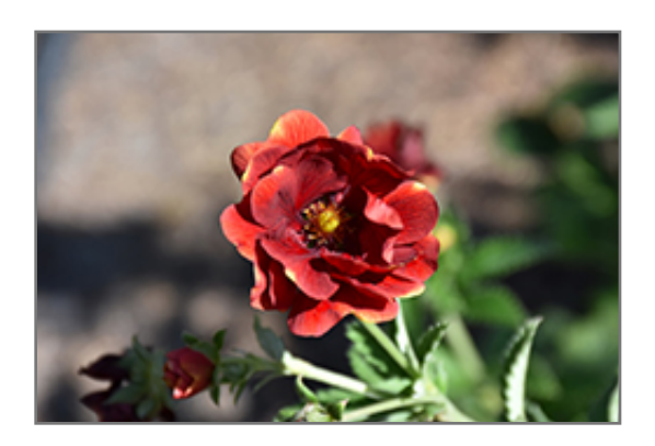
Arc En Ciel Cinquefoil flowers