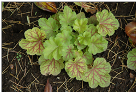
Electric Lime Coral Bells