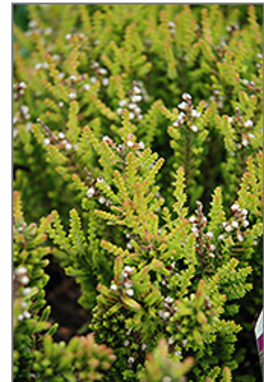
Firefly Heather foliage