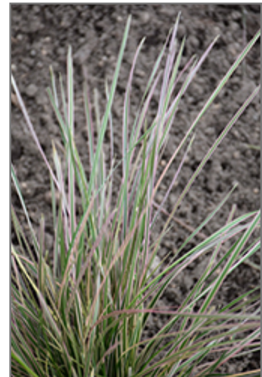
Northern Lights Tufted Hair Grass foliage