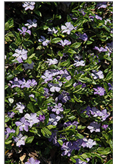
Common Periwinkle in bloom