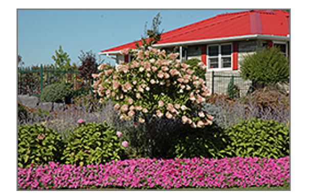
Tree Form Pee Gee Hydrangea in bloom

Tree Form Pee Gee Hydrangea will grow to be about 6 feet tall at maturity, with a spread of 6 feet. It tends to be a little leggy, with a typical clearance of 3 feet from the ground, and is suitable for planting under power lines. It grows at a medium rate, and under ideal conditions can be expected to live for 40 years or more.