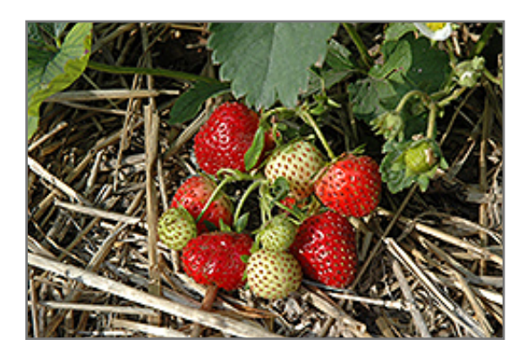
Everbearing Strawberry fruit