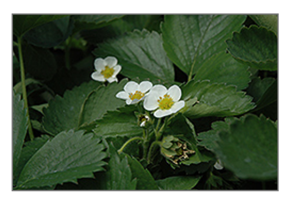
Everbearing Strawberry flowers