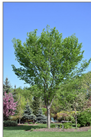
Brandon Elm