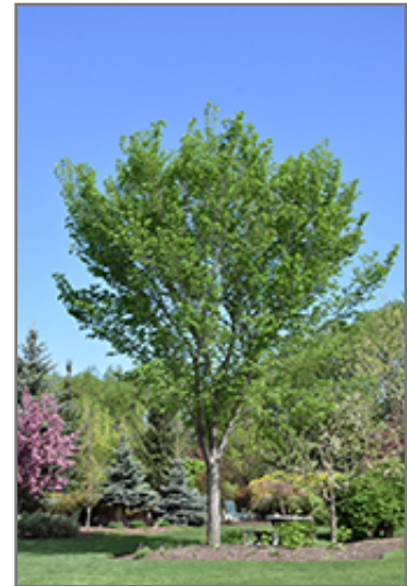
Brandon Elm