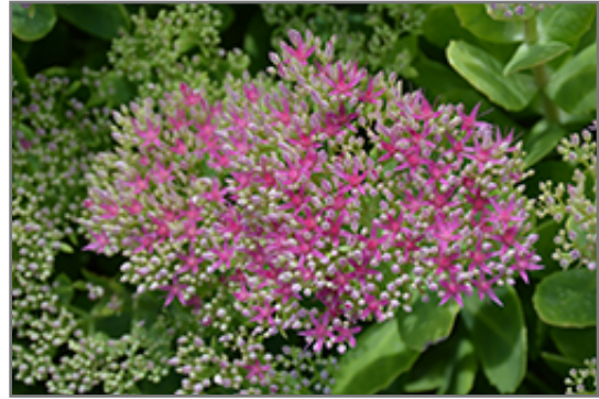
Neon Stonecrop flower buds

Neon Stonecrop will grow to be about 20 inches tall at maturity, with a spread of 20 inches. When grown in masses or used as a bedding plant, individual plants should be spaced approximately 16 inches apart. It grows at a fast rate, and under ideal conditions can be expected to live for approximately 15 years. As an herbaceous perennial, this plant will usually die back to the crown each winter, and will regrow from the base each spring. Be careful not to disturb the crown in late winter when it may not be readily seen!