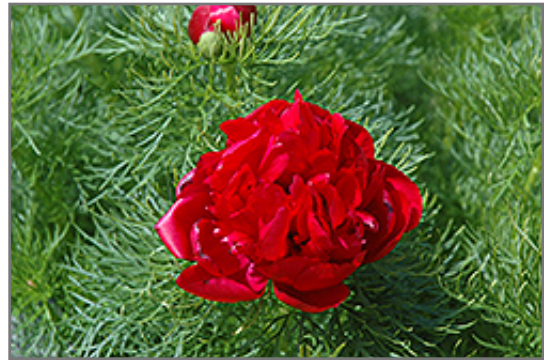
Double Fernleaf Peony flowers