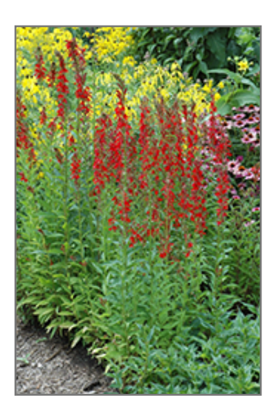
Cardinal Flower in bloom