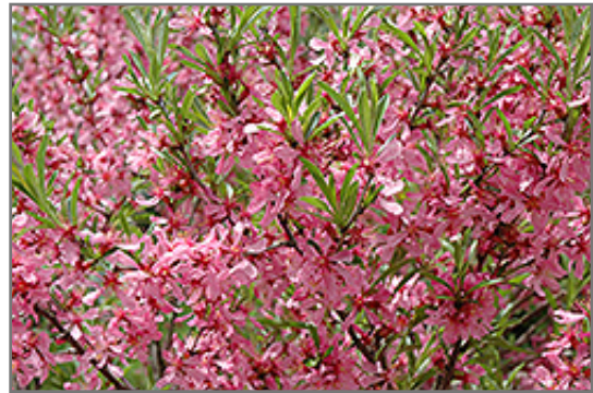
Russian Almond flowers