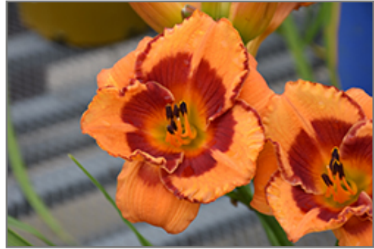
You Are My Sunshine Daylily flowers