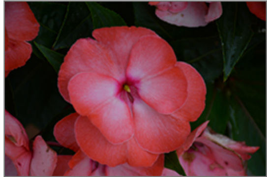
Painted Select Peach New Guinea Impatiens flowers

Painted Select Peach New Guinea Impatiens is recommended for the following landscape applications;