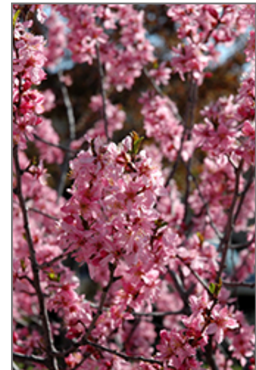
Muckle Plum (tree form) flowers