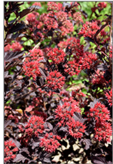
Center Glow Ninebark fruit