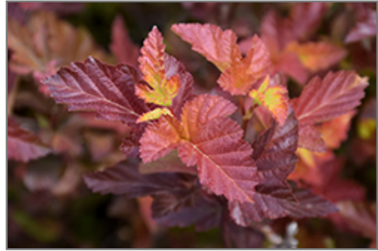
Center Glow Ninebark foliage

Center Glow Ninebark is recommended for the following landscape applications;