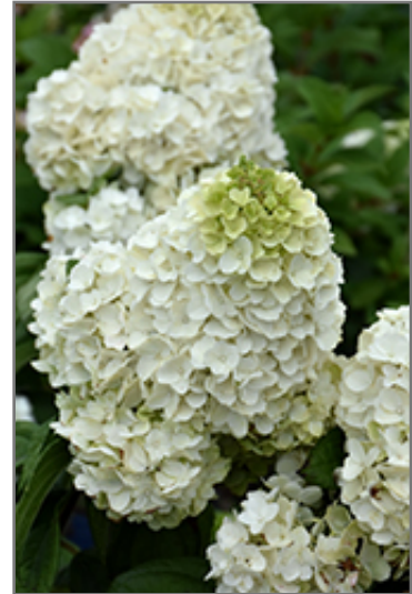
Moonrock Hydrangea flowers