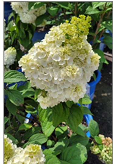
Moonrock Hydrangea flowers