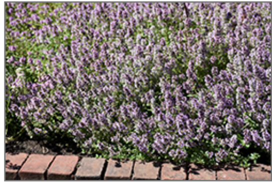
Common Thyme in bloom

Common Thyme is smothered in stunning clusters of pink flowers at the ends of the stems from early to mid summer. Its attractive tiny fragrant round leaves remain grayish green in colour throughout the year.