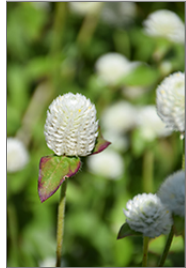
Las Vegas White Gomphrena flowers

Las Vegas White Gomphrena is recommended for the following landscape applications;