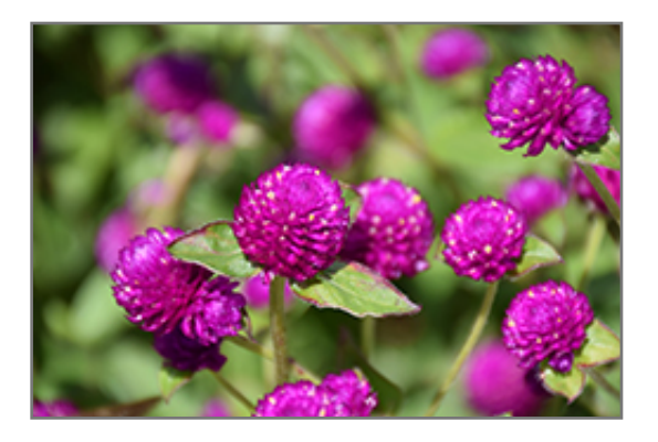
Las Vegas Purple Gomphrena flowers