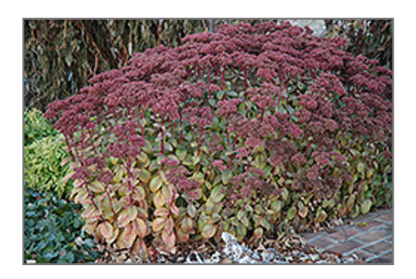
Matrona Stonecrop in fall