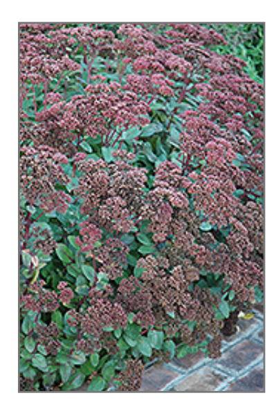
Matrona Stonecrop flowers

Matrona Stonecrop is recommended for the following landscape applications;