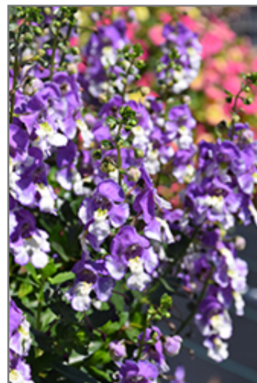
Alonia Big Bicolor Purple Angelonia flowers

Alonia Big Bicolor Purple Angelonia is recommended for the following landscape applications;