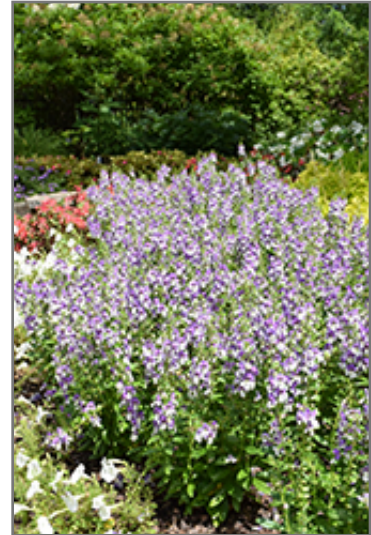
Alonia Big Bicolor Purple Angelonia in bloom

Alonia Big Bicolor Purple Angelonia is a fine choice for the garden, but it is also a good selection for planting in outdoor containers and hanging baskets. With its upright habit of growth, it is best suited for use as a 'thriller' in the 'spiller-thriller-filler' container combination; plant it near the center of the pot, surrounded by smaller plants and those that spill over the edges. Note that when growing plants in outdoor containers and baskets, they may require more frequent waterings than they would in the yard or garden.