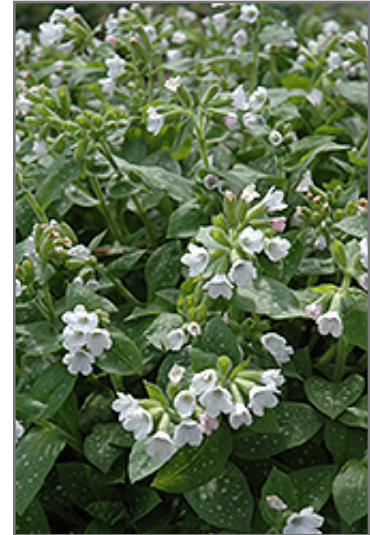
Sissinghurst White Lungwort flowers