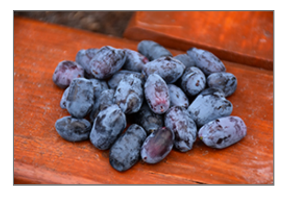
Boreal Blizzard Honeyberry fruit

Boreal Blizzard Honeyberry features subtle chartreuse flowers along the branches in early spring. It has green deciduous foliage. The narrow leaves do not develop any appreciable fall colour. It features an abundance of magnificent navy blue berries with powder blue overtones from early to mid summer.