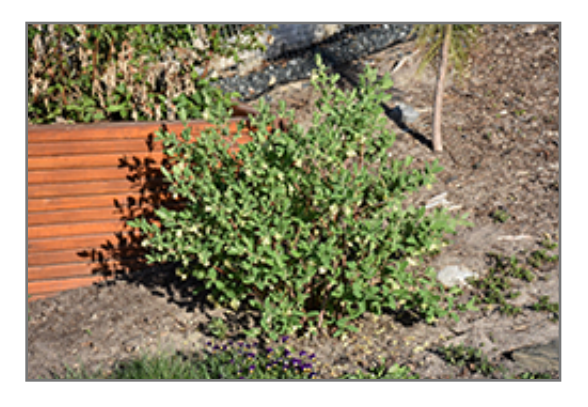
Boreal Blizzard Honeyberry in bloom