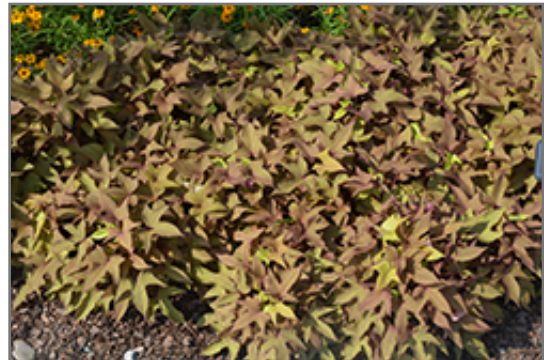
Sidekick Heart Bronze Sweet Potato Vine