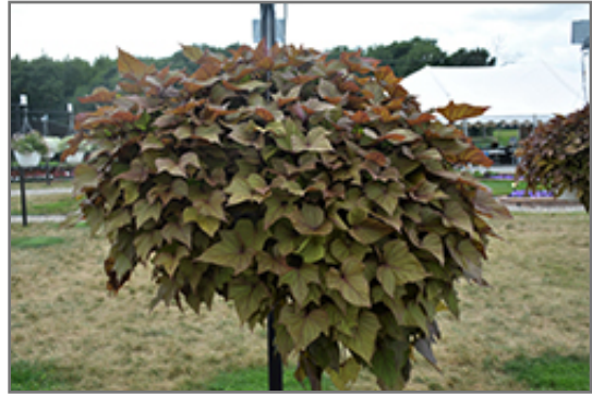
Sidekick Heart Bronze Sweet Potato Vine

* This is a 'special order' plant - contact store for details