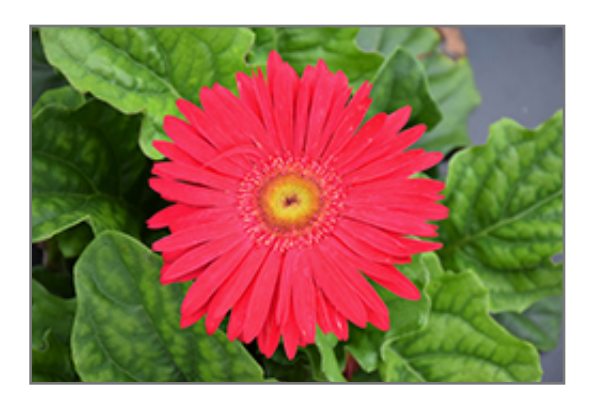
Jaguar Deep Rose Gerbera Daisy flowers

Tidy and compact, the Jaguar series boasts beautiful uniform flowers from spring until fall; deep rose blooms sit on top of dark green foliage; a great way to add color to garden, borders, containers and fresh cut flower arrangements; pollinator plant