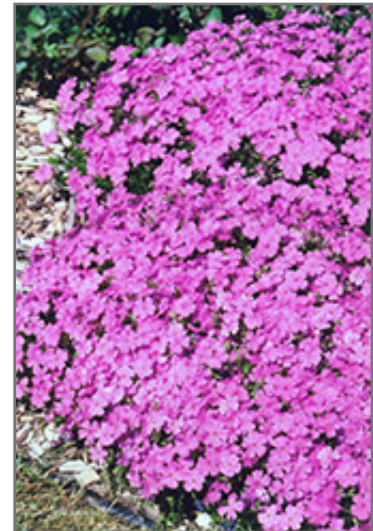
Arctic Phlox flowers