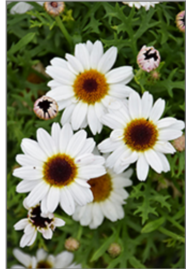
Grandaisy White Daisy flowers