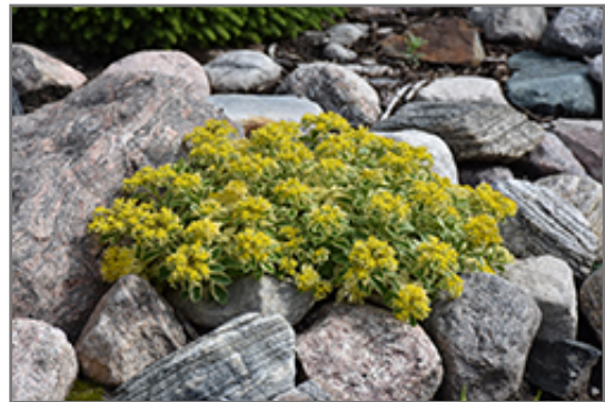
Atlantis Stonecrop in bloom