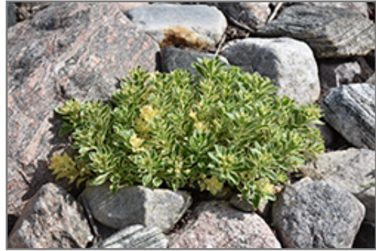
Atlantis Stonecrop