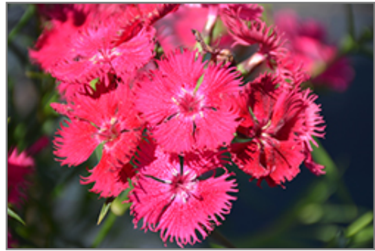
Rockin' Rose Pinks flowers

Rockin' Rose Pinks is recommended for the following landscape applications;