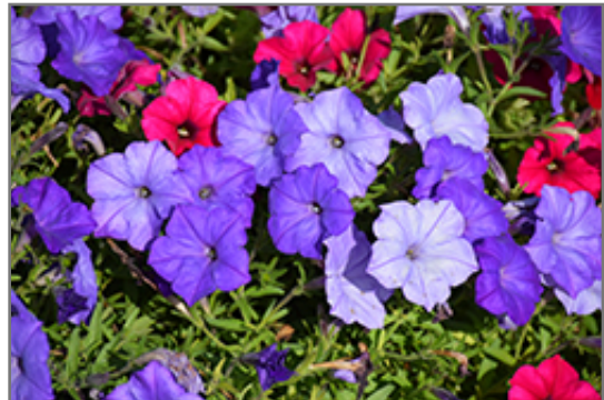
Easy Wave Lavender Sky Blue Petunia flowers