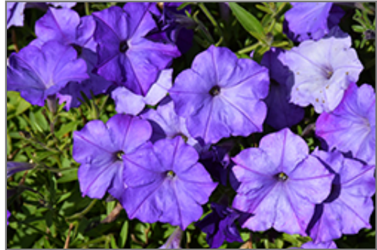
Easy Wave Lavender Sky Blue Petunia flowers

This plant will require occasional maintenance and upkeep. Trim off the flower heads after they fade and die to encourage more blooms late into the season. It is a good choice for attracting bees and hummingbirds to your yard, but is not particularly attractive to deer who tend to leave it alone in favor of tastier treats. It has no significant negative characteristics.