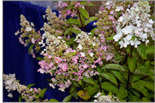
Candelabra Hydrangea flowers