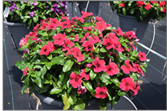
Tattoo Black Cherry Vinca in bloom

Tattoo Black Cherry Vinca is a fine choice for the garden, but it is also a good selection for planting in outdoor containers and hanging baskets. It is often used as a 'filler' in the 'spiller-thriller-filler' container combination, providing a mass of flowers against which the thriller plants stand out. Note that when growing plants in outdoor containers and baskets, they may require more frequent waterings than they would in the yard or garden.