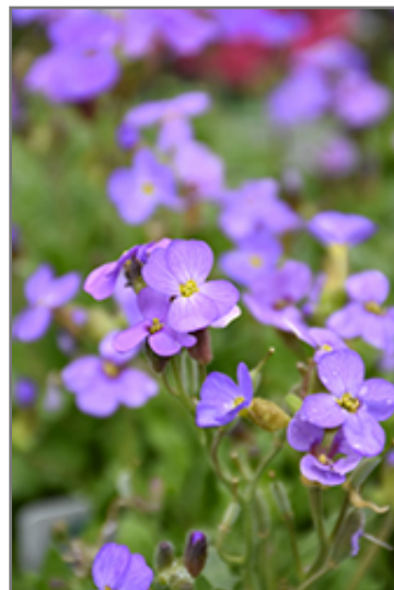
Cascade Blue Rock Cress flowers